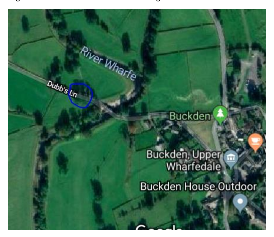
Leg 9 Just near the bridge where the DW path crosses