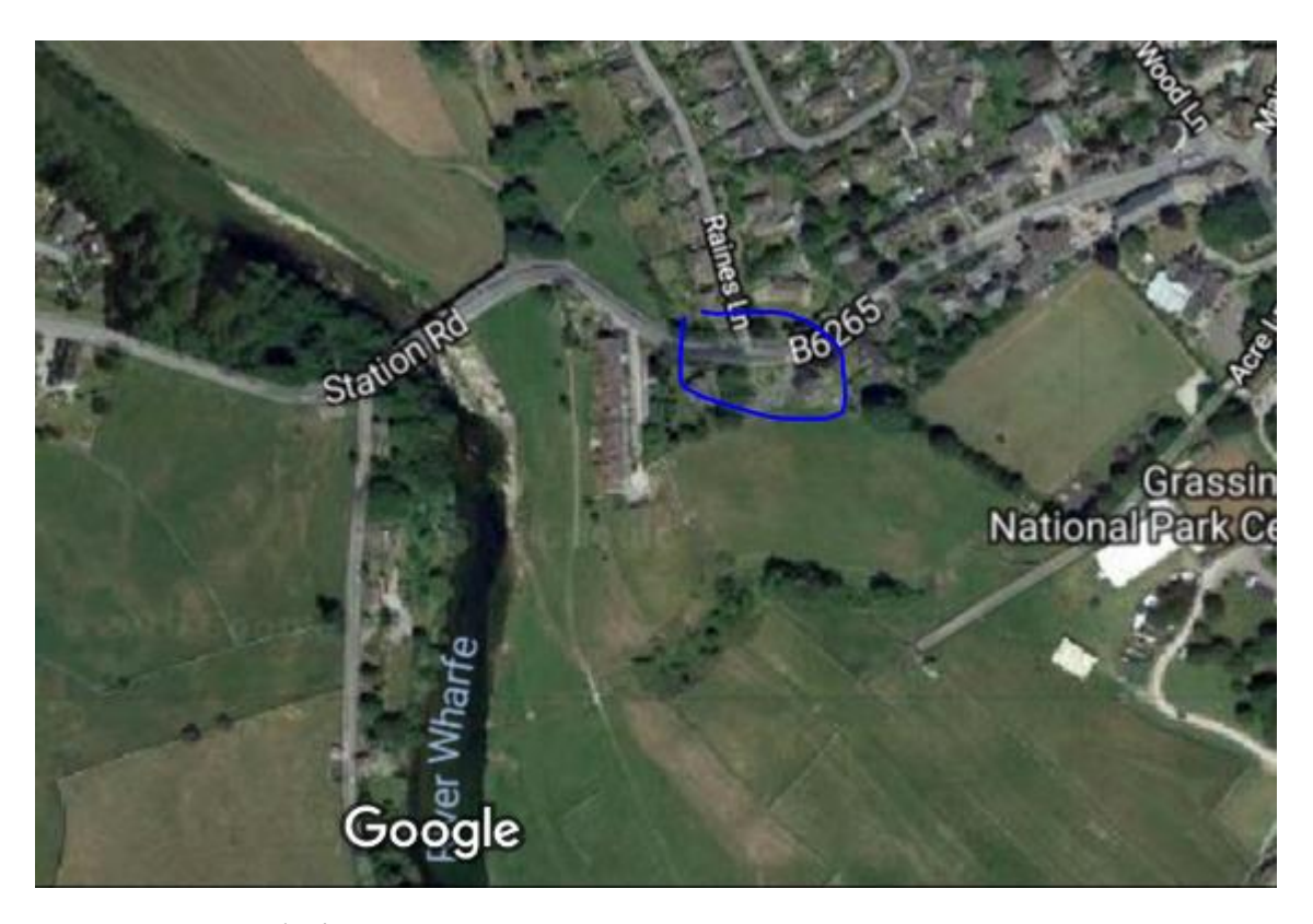
Leg 11 on another 'B..' Bridge