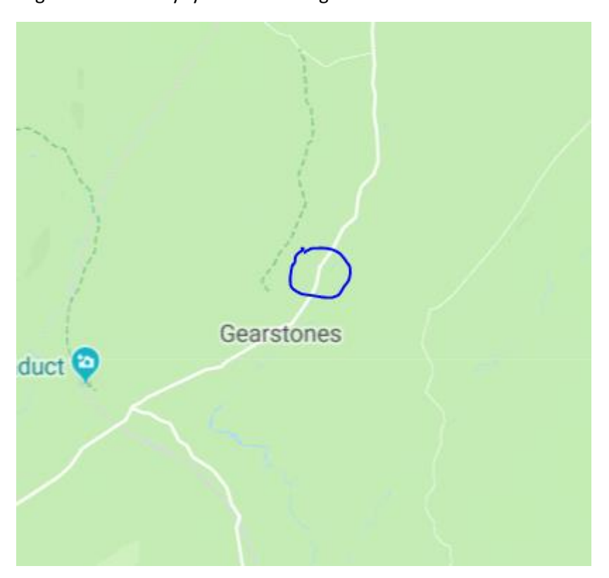
Leg 7 Beckermonds Where track ends and DW path starts the Wharfe